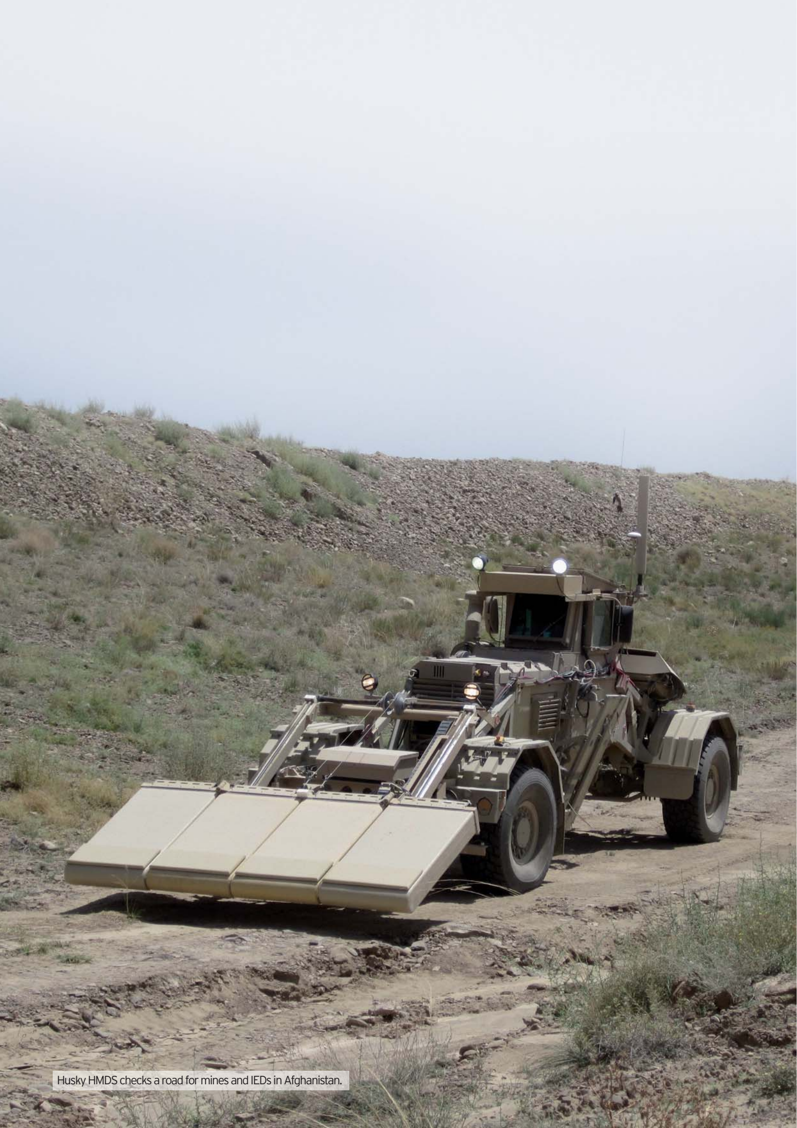
Husky HMDS checks a road for mines and IEDs in Afghanistan.