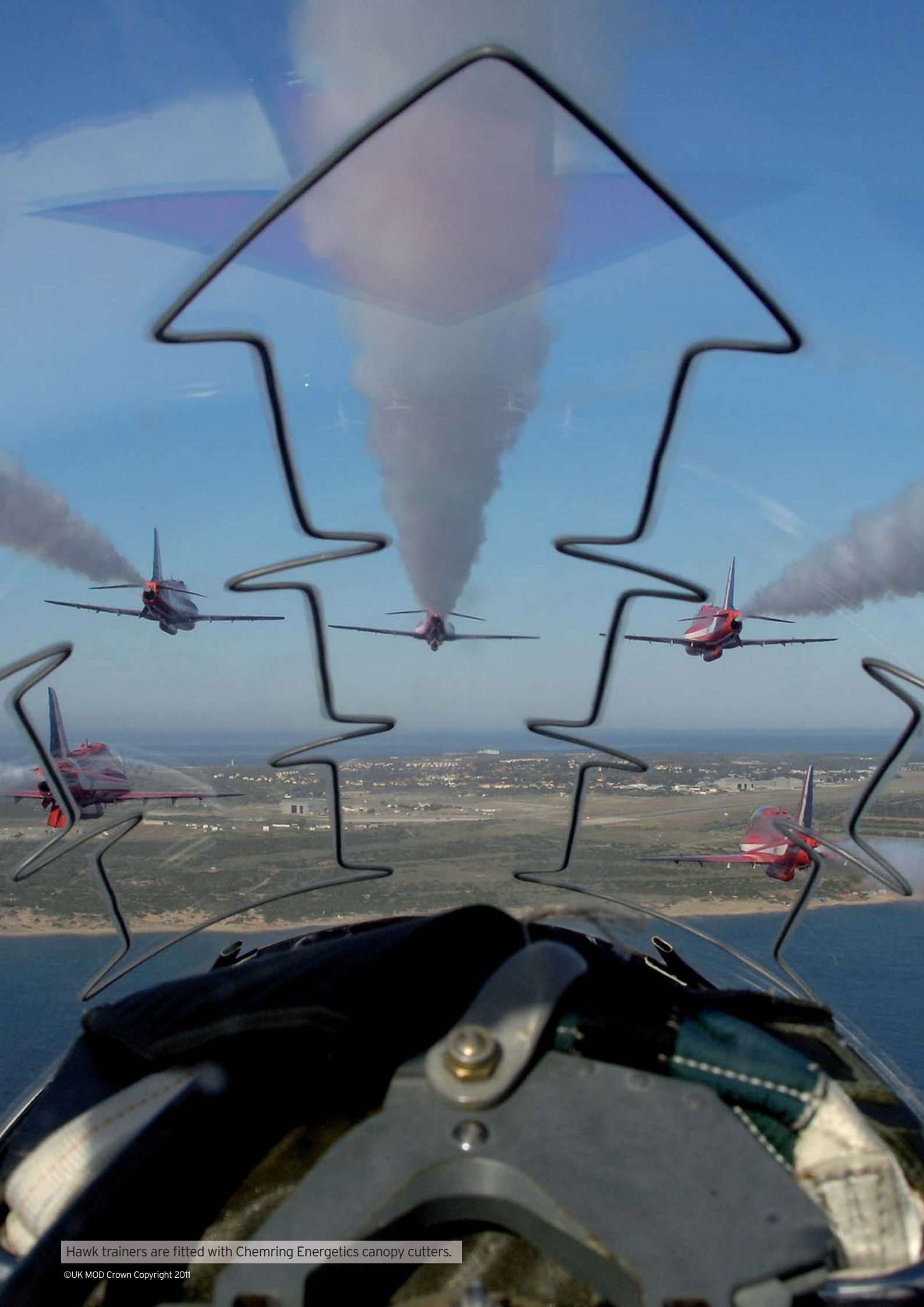
Hawk trainers are fitted with Chemring Energetics canopy cutters.