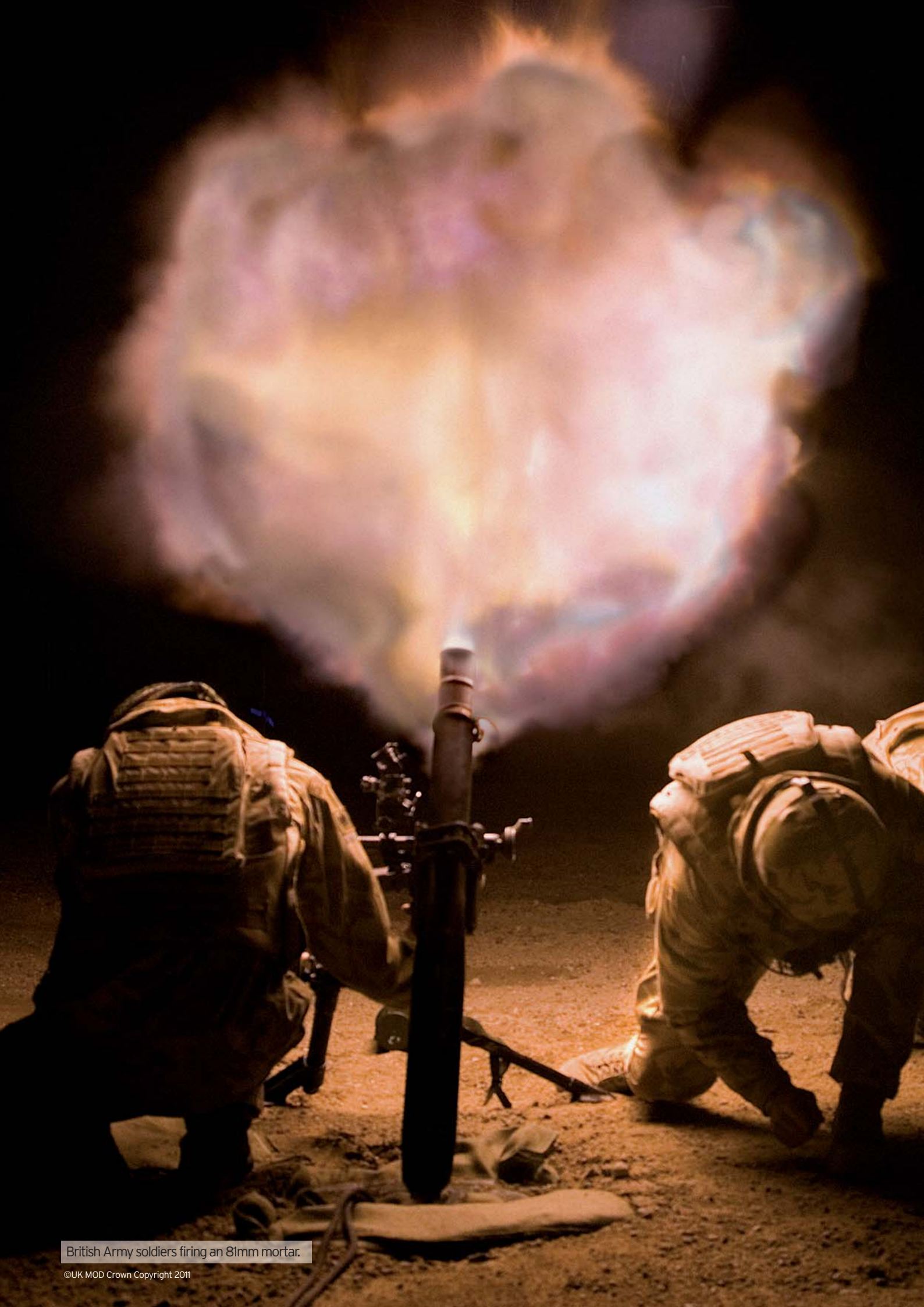
British Army soldiers firing an 81mm mortar.