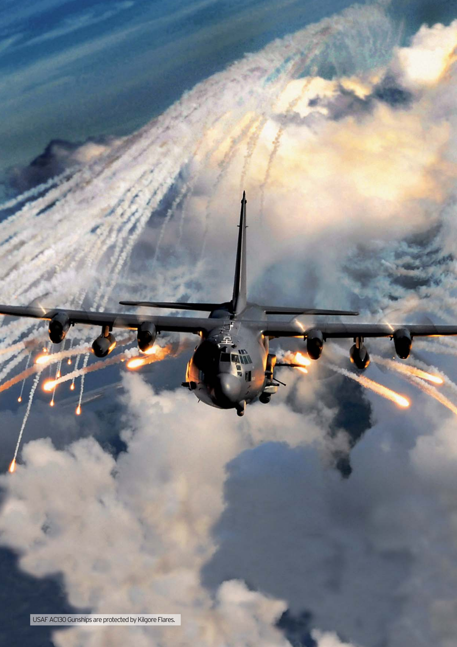
USAF AC130 Gunships are protected by Kilgore Flares.